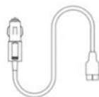
12V-14V car charger cable